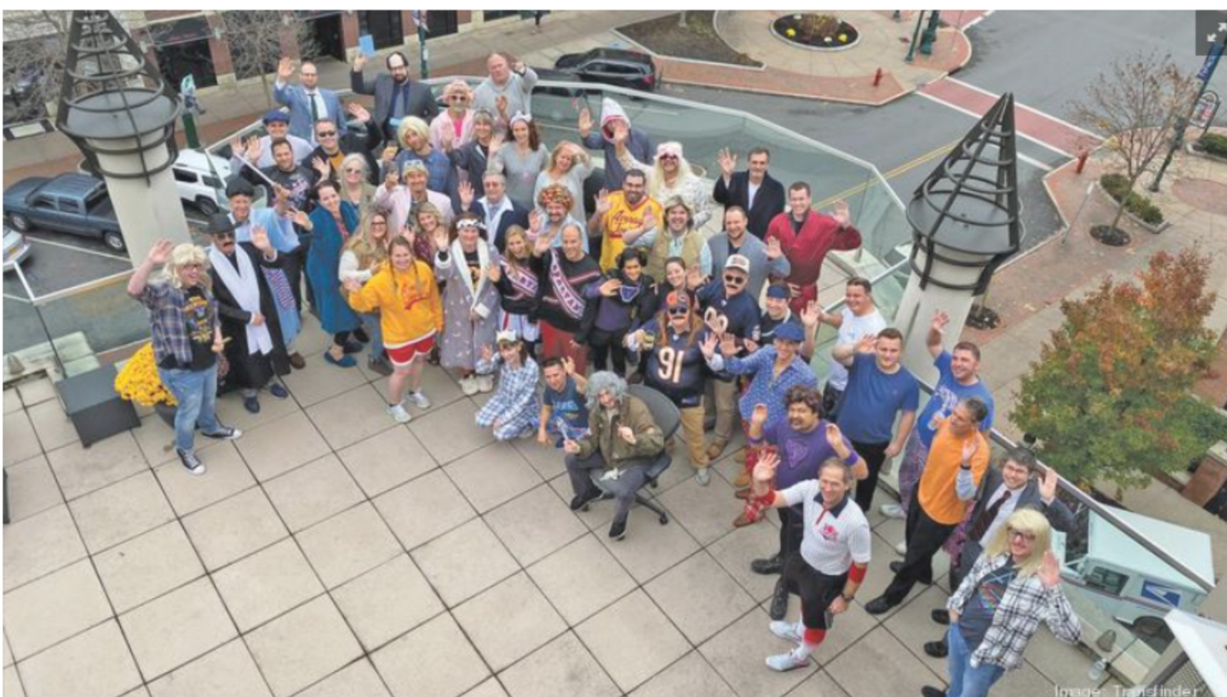
Transfinder is a 2022 Best Places to Work winner.

Email Share Share Tweet Share Article Print Order Reprints