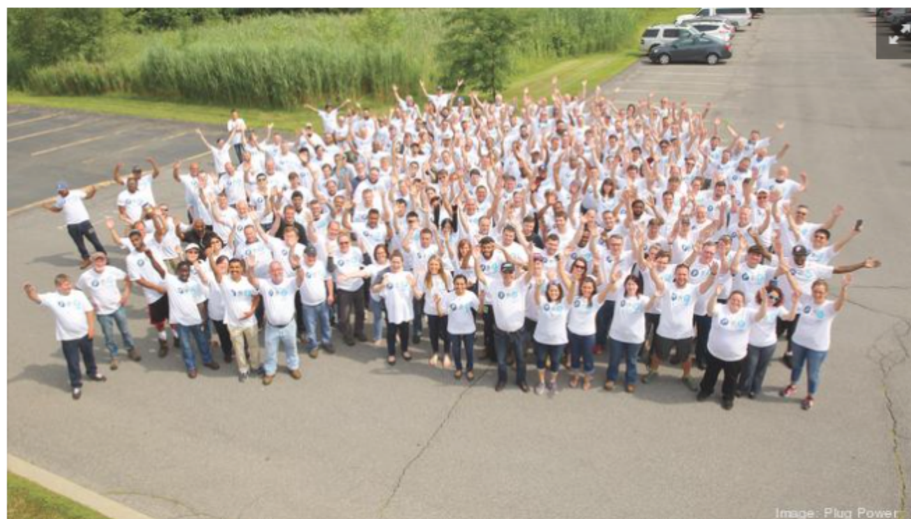
Plug Power is a 2022 Best Places to Work winner.